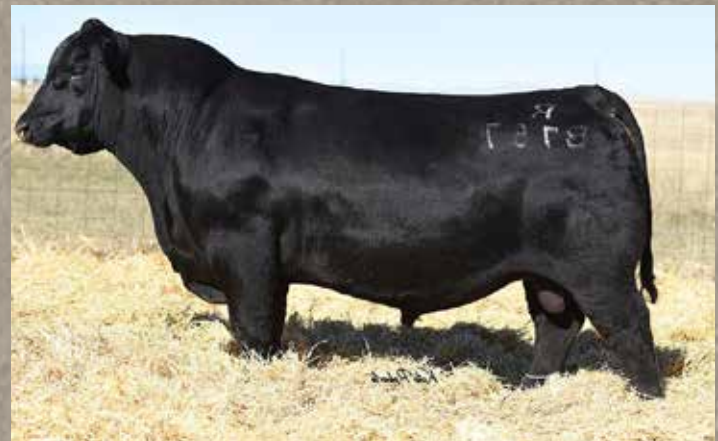
TEHAMA TAHOE B767