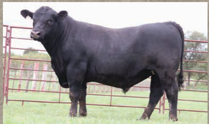
LOT 47 S ROCK REBOUND 824F7

Calving ease, performance, efficiency & muscle, what more can you ask. These Rebound sons are really nice and his dam is a near ideal young Koupal Advance x Coneally Thunder x 004 x VRD back to the foundation Traveler daughter, O C C Dixie Erica 824B. His daughters should be keepers and his sons should make herd sires and range bulls. CED 20%, BW 30%, WW 20%, YW 25%, RADG 30%, CEM 35%, REA 10%, $W 20%.