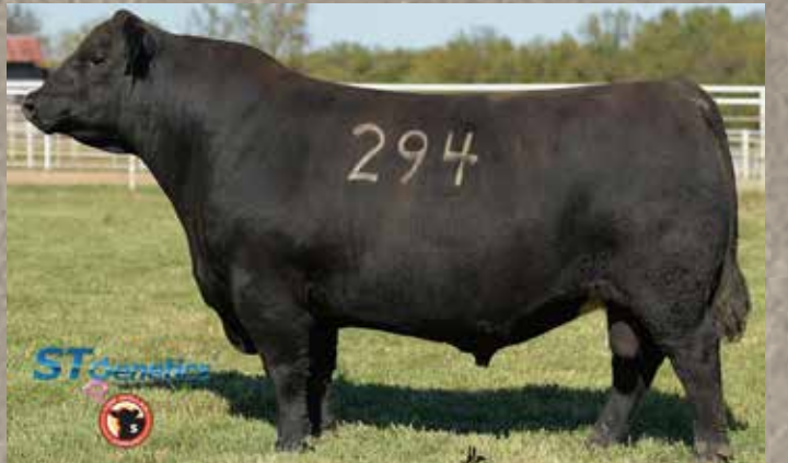
SIRE OF LOT 41 J&J WEIGH UP 294

Calving ease with performance in this big spread, balanced trait Sonic son. Sonic, the sire of DL Dually, worked really good in the Solid Rock Ranch herd. Unfortunately his semen is virtually unavailable now. Granddam is a great producing, near ideal Angus cow reflecting the cow power throughout the sale. CED 35%, BW 20%, WW 15%, YW 15%, SC 20%, CEM 35%, $W 20%.