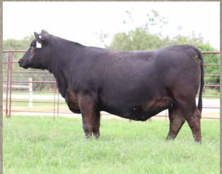
Lot 115 | Ms S Rock Queen 335G50 | Reg #: 19787974

TO VIEW CATALOG, VIDEOS, SALE ORDER AND SALE SUPPLEMENT, PLEASE VISIT: www.amscattle.com/auction/cowmaker-bull-female-sale-2020/