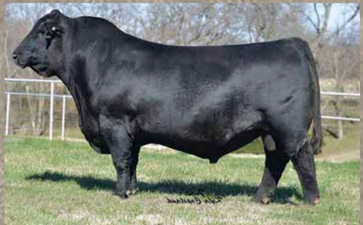
BUFORD BLACKJACK A414