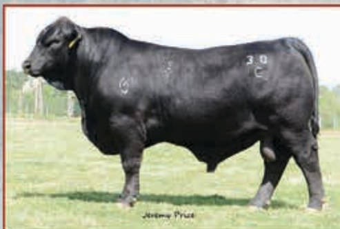
< SUHN'S MAJESTIK BEACON 30C $40/unit