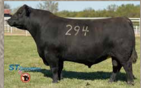
SIRE OF LOT 20 J & J WEIGH UP 294