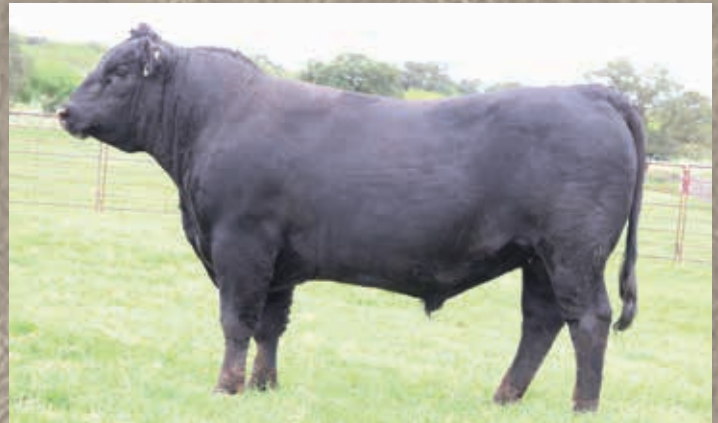
LOT 11 S ROCK REBOUND 335F49

Flashy Rebound son out of a Thunder x Final Answer x O C C Glory x EXT dam. Maternal throughout his pedigree. Great combination of calving ease and growth. CED 15%, BW 25%, WW 25%, YW 30%, RADG 15%, HP 30%, CEM 10%.