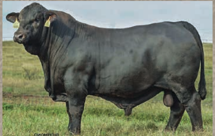
SIRE OF LOT 94 HOLLYWOOD OF SALACOA 23A53

He is another calving ease prospect out of the 881E Presidente son we are using cleanup. His dam is a 231A daughter. He posts top 25% CED and top 35% BW EPDs.