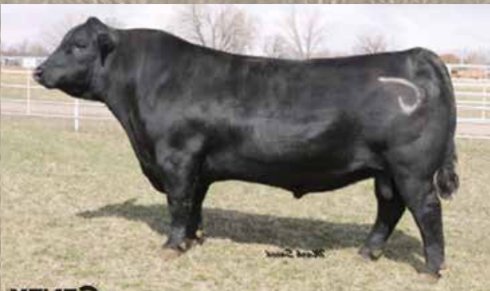
SIRE OF LOT 131 CONNEALY THUNDER

Thunder x In Focus has also been a really good cross in this herd. Her two full sisters have been good producers. Calving ease with plenty of growth and optimal milk in a very functional and attractive package. CED 10%, BW 3%, SC 30%, DOC 25%, HP 35%, CEM 15%.