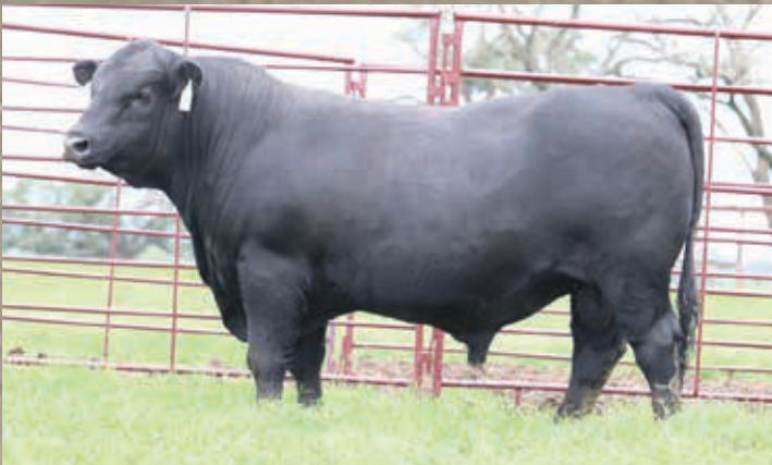
Lot 79 | S Rock Jet Black 5028G3 | Reg #: 19789734