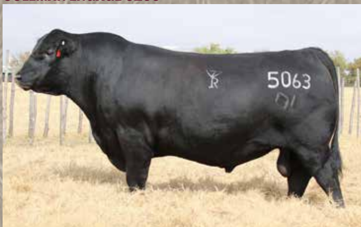
BAR R JET BLACK 5063