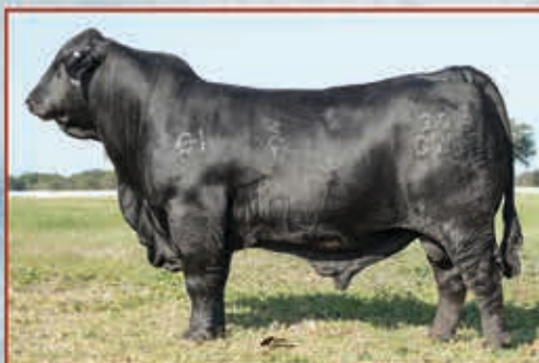
< SUHN'S BUSINESS LINE 30D26 $50/unit