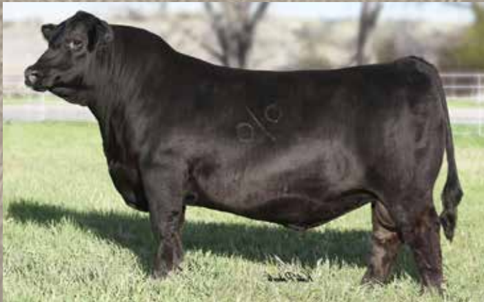
COLEMAN ENGAGE 5255