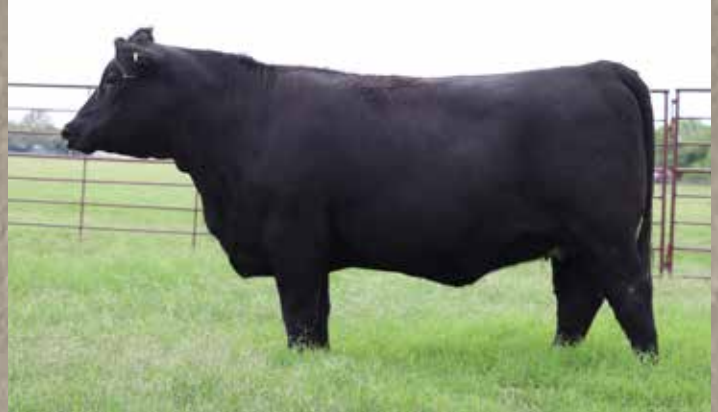
LOT 131 MS S ROCK S LUCY 4876G2

Study the spread in her EPD profile, she offers a lot of mating flexibility and the potential to produce some really good ones. Sonic daughter with Really Windy x Final Answer x Thunder out of a R R 9440 Scotch Cap 1483 daughter that is super attractive and adds a little size. CED 35%, BW 15%, WW 10%, YW 10%, SC 10%, DOC 25%, HP 25%, CWT 40%, Marb 40%, $W 35%.