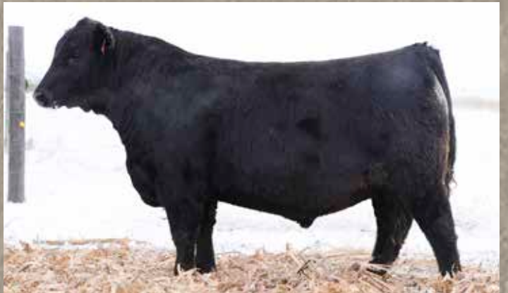
SIRE OF LOT 142 BLACKTOP CASH CROP

Moderate, pretty fronted, big bodied Charlo daughter. Dam is a really nice VDAR Really Windy 4097 daughter and granddam is still in the herd as a 15 year old cow. Son sells as lot 7 and maternal sister sells as lot 102. BW 30%, SC 25%.