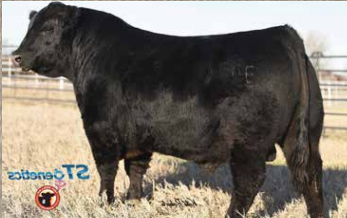
C BAR UNCONTESTED 6209