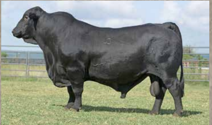
SIRE OF LOT 95 STONEWALL OF RRR 222W6

THANKS to Standley Feeds for sponsoring the food again this year.