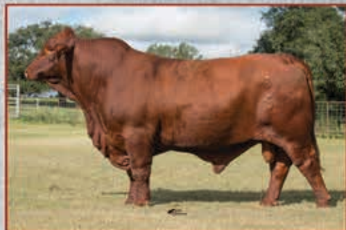
HARRIS "NAVIDAD" 8/5 > $50/unit