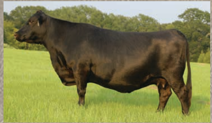
MATERNAL GRANDDAM OF LOT 116 DEER CREEK EXT 335