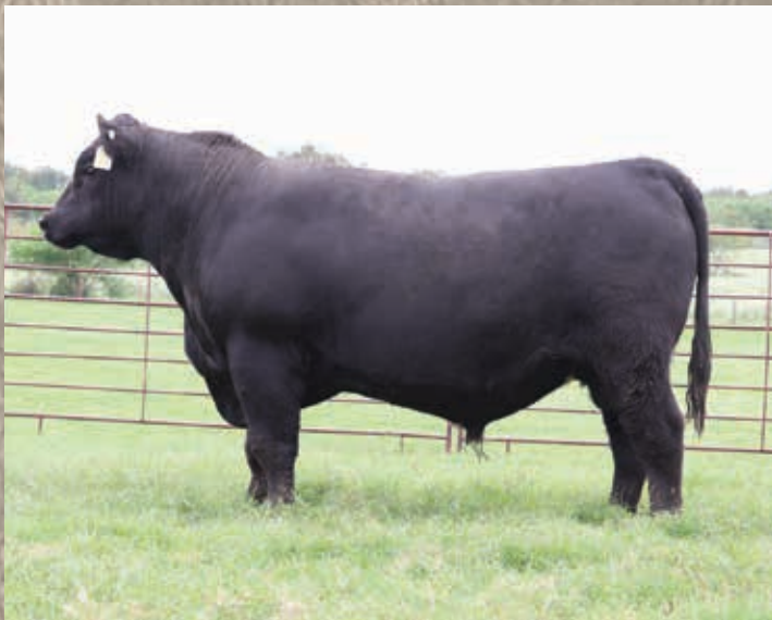
Lot 20 | S Rock Weigh Up 335G5 | Reg #: 19789712

PO Box 10 Wheelock, Texas 77882 www.amscattle.com