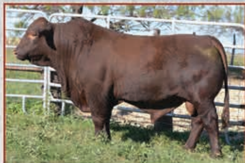
SR GENESIS 75/3 > $50/unit