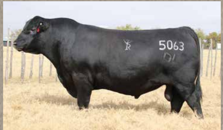
SIRE OF LOT 21 BAR R JET BLACK 5063

Jet Black son with calving ease, performance and marbling. CED 35%, BW 40%, WW 30%, SC 40%, Marb 15%, $W 20%, $B 40%.