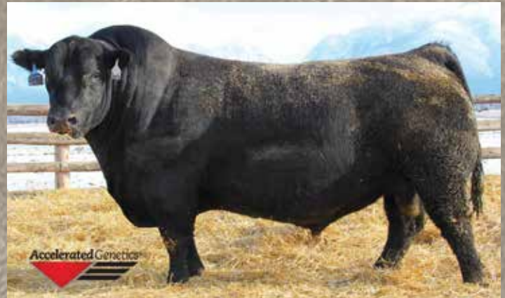
SIRE OF LOT 19 COLEMAN CHARLO 335G

Low birth weight Charlo son out of a Thunder daughter of the Ms S Rock Glory 335R8 donor. The Thunder daughters are some of the best cows in the breed and have done an outstanding job in the Solid Rock Ranch herd. BW 20%.