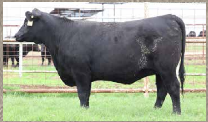
LOT 118 MS S ROCK BONNIE 769F8

An extremely low birth weight Sonic daughter, she calved a bit early hence the "F" year code. The Bonnie 769 family are consistently high producing cows and she is a granddaughter of the foundation PAPA Durabull daughter, 769L. CED 2%, BW 1%, DOC 25%, HP 25%, CEM 15%.