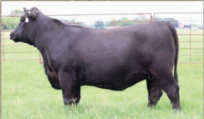
LOT 124 MS S ROCK IDEAL 2243G

Really low birth weight daughter of the up and coming herd sire, S Rock Black-jack 2243E2. CED 3%, BW 2%, DOC 25%, HP 25%, Milk 10%, Marb 40%.