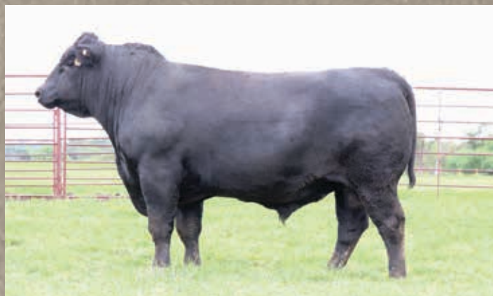
LOT 73 S ROCK BLACK GRANITE 5028F9

Low birth weight Pathfinder son out of a really flashy Really Windy dam. His granddam by Bennet Total is also a really nice cow. His daughters should make very productive and broody females with a lot of look. CED 30%, BW 30%, WW 40%, CEM 35%, $W 15%.