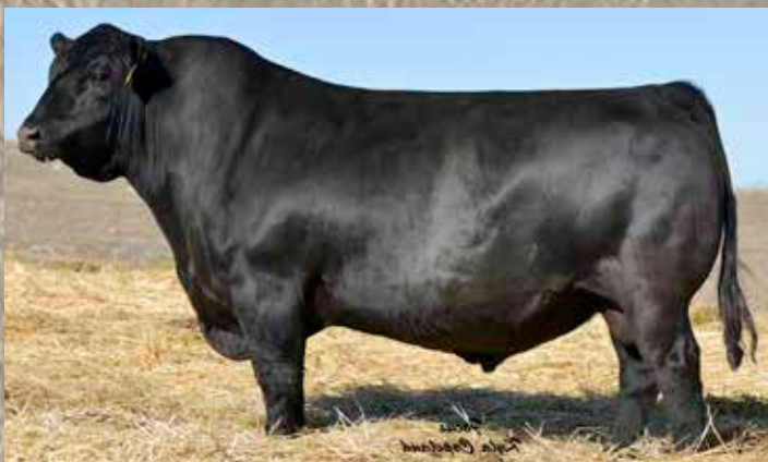
PATERNAL GRANDSIRE OF LOT 32 BASIN PAYWEIGHT 1682

His dam, a direct daughter of Coneally Timeline out of the foundation Deer Creek EXT 335 donor, always produces one of my heaviest & stoutest calves. This linebred 335 bull should sire the same and add some consistency to your herd. HP 25%.