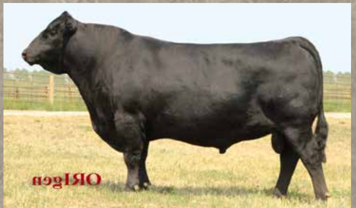
SIRE OF LOT 109 DL SONIC 444

DL Sonic daughter with top of the breed weaning and yearling and added carcass merit. Dam has been a really good producer. Her donor granddam is the dam of the stout Resource son selling as lot 26 and will have several top lots next year by Charlo and Jet Black. She is one to build a herd around. WW 5%, YW 10%, DOC 30%, CEM 15%, CWT 20%, $W 20%, $B 25%.