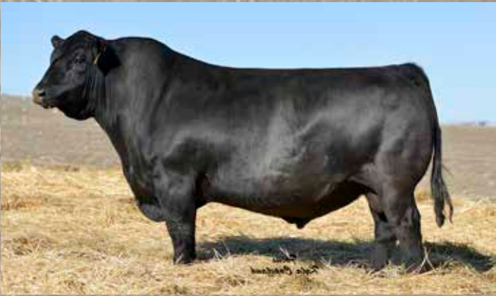
PATERNAL GRANDSIRE OF LOT 110 BASIN PAYWEIGHT 1682