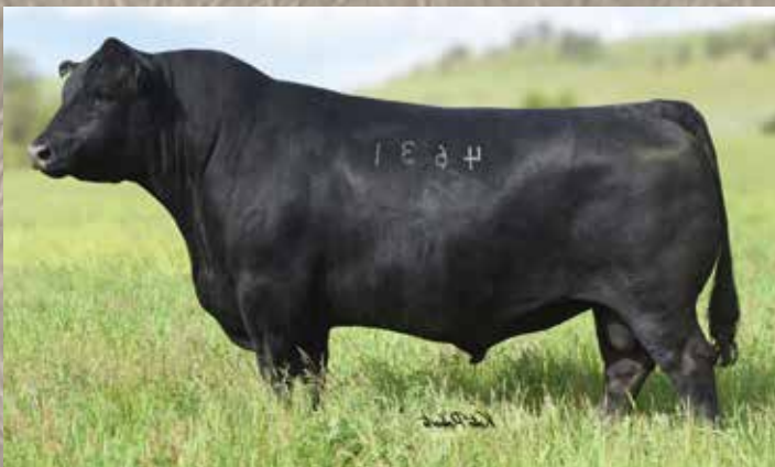
SIRE OF LOT 43 3F EPIC 4631

Another spread bull with negative birth and 100 YW. J&J Weigh Up 294 is another sire that worked really well for us. Dam is the granddam of the previous lot. She consistently produces good ones. CED 30%, BW 15%, WW 30%, SC 40%, DOC 25%, Marb 40%, $W 40%.