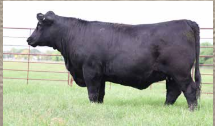
Lot 121 | Ms S Rock RR Blackbird 846G2 | Reg #: 19789731