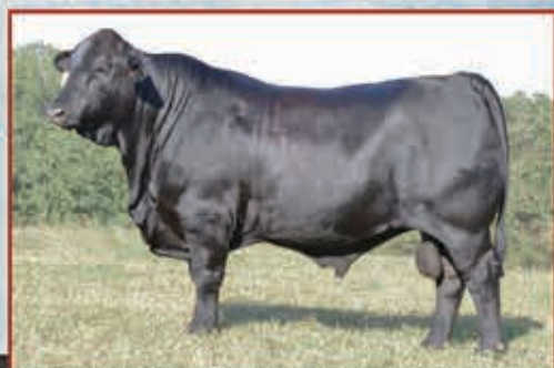
DMR LOUISIANA PURCHASE 924D10 > $40/unit