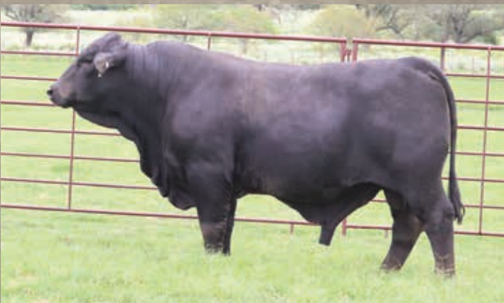
Lot 86 | S Rock Billy the Kid 98F | Reg #: R10410809