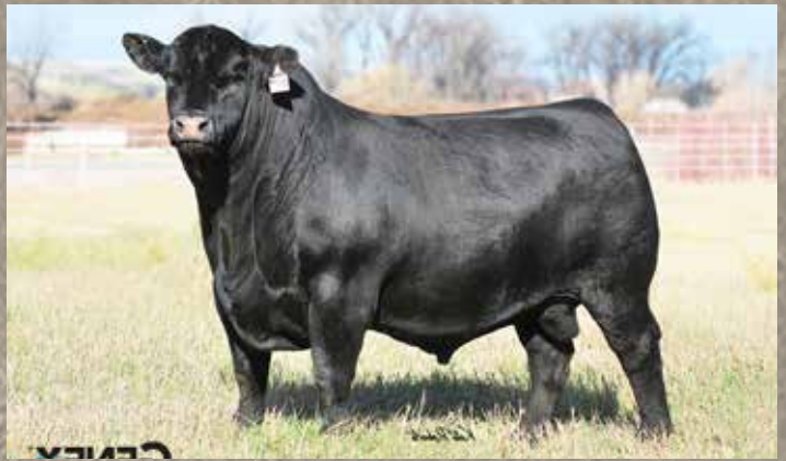
SIRE OF LOT 128 BUFORD PATHFINDER C304

Low birth weight Pathfinder daughter out of a consistently good producing C C A Emblazon 702 dam. The 702's in my herd are good producers that are moderate with great udders. I am anticipating Pathfinder daughters and those of his full brother-in-blood, Rebound, are going to make great cows. Their dam is a tremendous Bismarck daughter from the S A V Elba family and the Resource and Renown daughters have made good cows across the country and beyond. CED 3%, BW 15%, HP 40%, CEM 30%, Milk 10%, $W 5%.