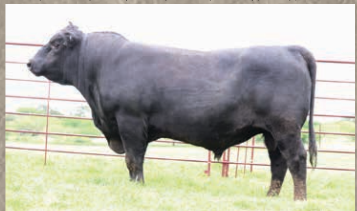
LOT 14 S ROCK BLACK GRANITE 335F53

Balanced trait Epic son out of a really complete and productive female that always produces top end calves. Granddam is a full sister to the dam of the previous lot. We had three of these Newsline x Deer Creek EXT 335 females and all did an outstanding job. The S Rock Payweight 1682 335C9 service sire is out of another sister. CED 20%, BW 20%, WW 25%, YW 15%, RADG 10%, SC 35%, CEM 1%, CWT 10%, REA 15%, $W 40%, $B 4%.