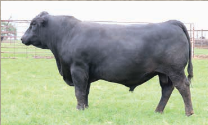
Lot 52 | S Rock Blackjack 846G4 | Reg #: 19787982