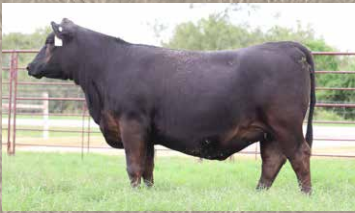
LOT 115 MS S ROCK QUEEN 335G50