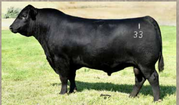
SIRE OF LOT 67 CONNEALY BLACK GRANITE

Big spread Charlo son out of a Thunder daughter of the foundation 4876 Lucy cow. Proven maternal pedigree, daughters should be really nice. BW 25%, WW 15%, YW 25%, $W 15%.