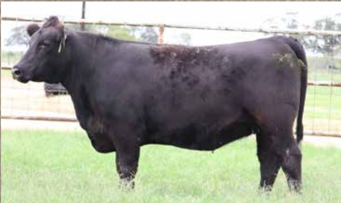
LOT 117 MS S ROCK ELIRA 639G

Lookout x Newsline breeding. Dam is the dam of the S Rock Payweight 335C9 herd sire and granddam is the foundation EXT daughter, Deer Creek Ext 335. YW 40%, RADG 20%, HP 20%.