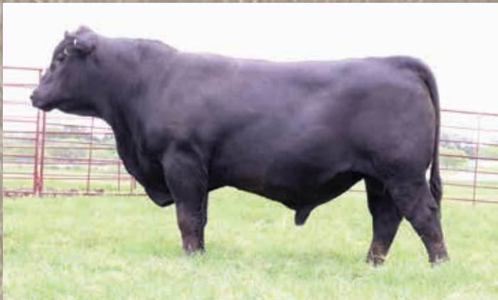
LOT 48 S ROCK SONIC 824G

Sonic son with added performance. Very complete Really Windy x Final Answer bred dam sells as lot 159. WW 15%, YW 25%, DOC 30%, HP 30%, $W 25%.