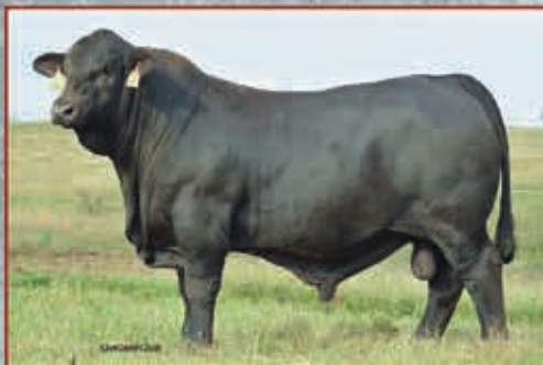
< HOLLYWOOD OF SALACOA 23A53 $50 Registered, $25 Commercial