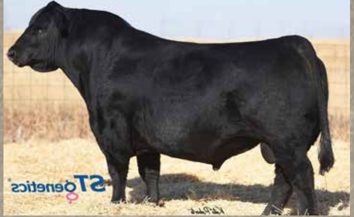
OX BOW OZZIE 3233