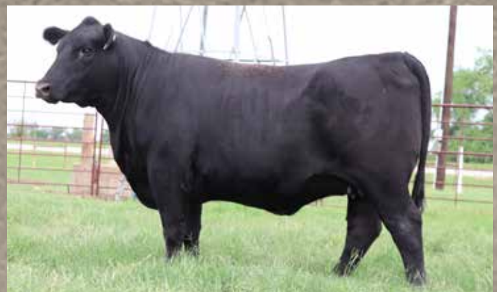
Lot 140 | Ms S Rock Barbaramere 6001G | Reg #: 19789741

WEDNESDAY, NOVEMBER 4, 2020 | CROCKETT, TEXAS