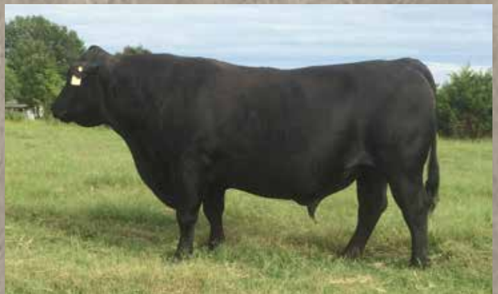
SIRE OF LOTS 29-31 S ROCK REALLY WINDY 335A

Another S Rock Really Windy 335A son with added performance, they tend to have just a touch more frame and be a little slicker haired and structurally correct. His sons have been very well received in past sales and his daughters are making good cows as well. WW 30%, YW 30%, RADG 30%, HP 40%, CEM 25%.