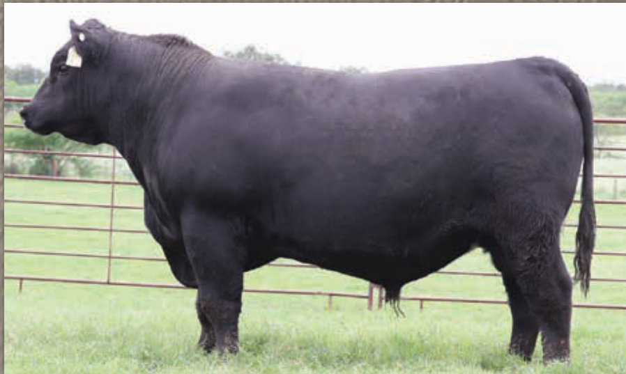
LOT 20 S ROCK WEIGH UP 335G5