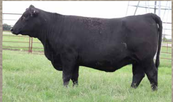
Lot 135 | Ms S Rock Sunset Pride 5028G | Reg #: 19789698