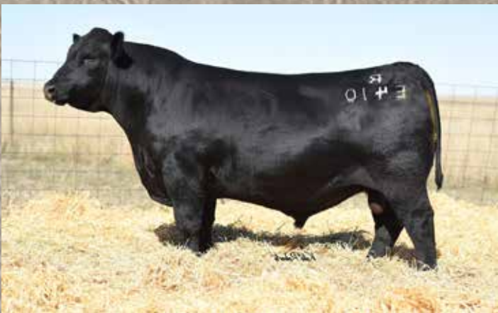
TEHAMA BONANZA E410