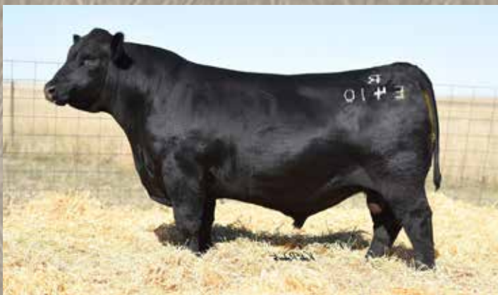
AI SERVICE SIRE FOR LOT 141 TEHAMA BONANZA E410