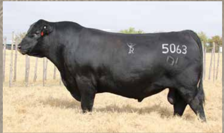
SIRE OF LOTS 79 & 80 BAR R JET BLACK 5063

Another Jet Black son, he has added growth and muscle. WW 25%, YW 25%, RADG 40%, SC 40%, Milk 35%, CWT 15%, REA 30%, $W 25%, $B 20%.