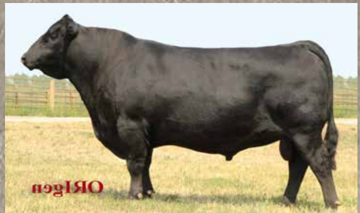
SIRE OF LOT 44 DL SONIC 444

Another negative birth weight, calving ease Sonic son. CED 20%, BW 5%, SC 4%, DOC 10%, Milk 20%, $W 25%.