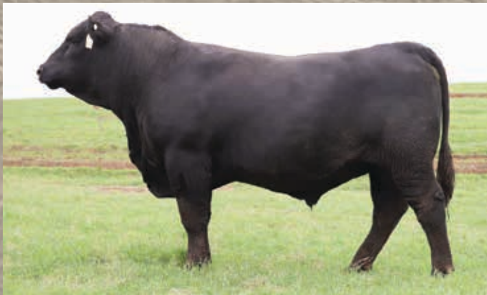
Lot 24 | S Rock Pathfinder 335G10 | Reg #: 19789725