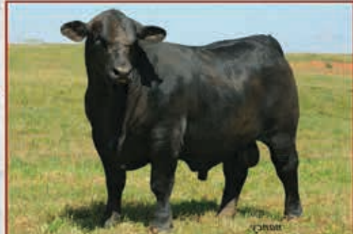
ATLANTA OF SALACOA 488Z > $50 Registered, $25 Commercial