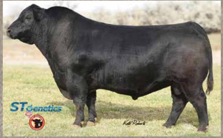
MUSKGRAVE 316 EXCLUSIVE