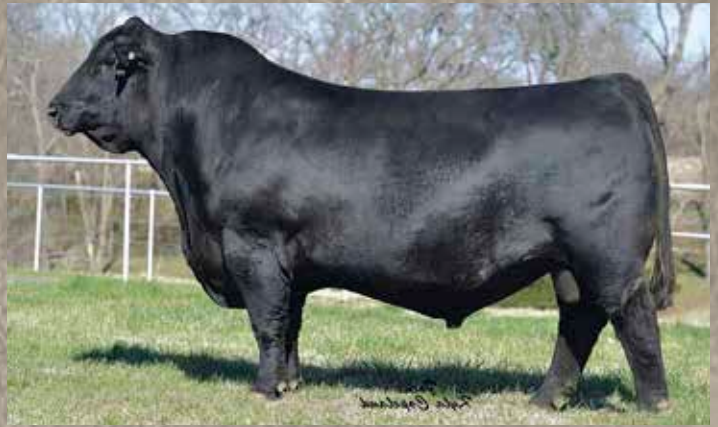
PATERNAL GRANDSIRE OF LOT 28 BUFORD BLACKJACK A414