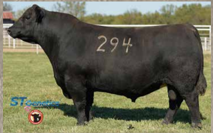
AI SERVICE SIRE FOR LOT 143 J&J WEIGH UP 294