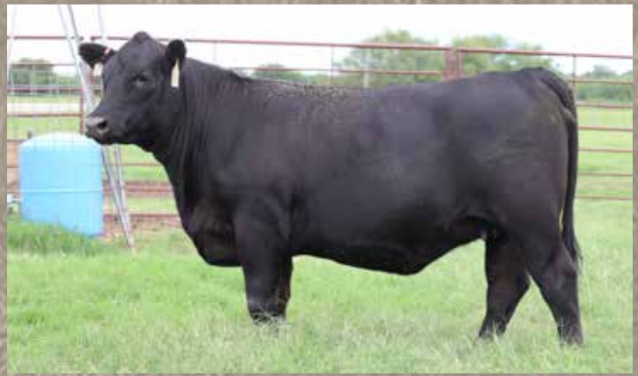
LOT 111 MS S ROCK QUEEN 335G43

Really attractive linebred 335 female. Great females all through her pedigree. Maternal sister sells as lot 150. Another one to build a herd around. CED 20%, SC 25%, HP 30%, CEM 4%, Milk 40%.