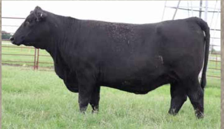
LOT 135 MS S ROCK SUNSET PRIDE 5028G

Really nice deep bodied, big ribbed, broody, balanced trait Sonic daughter from the Sunset Pride 5028 family. She has cow written all over her. BW 30%, WW 25%, YW 20%, SC 30%, DOC 40%, Marb 25%, $W 40%.