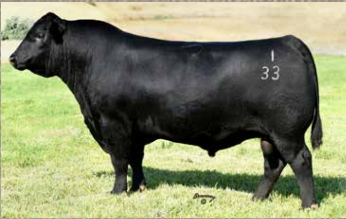
CONNELY BLACK GRANITE