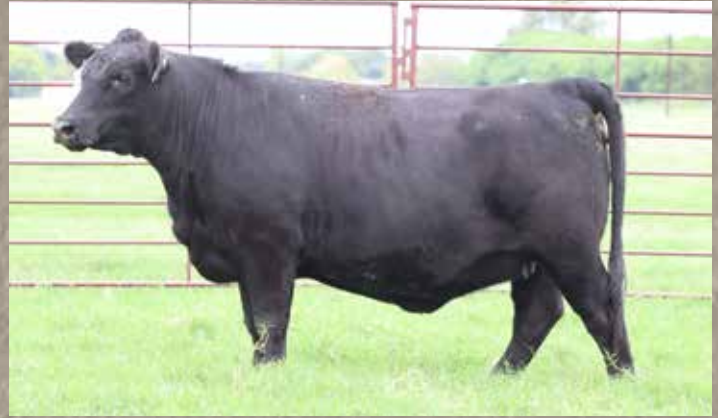
LOT 114 MS S ROCK QUEEN 335G49

Moderate framed, big bodied female with a balanced EPD profile that offers a world of mating possibilities. Dam sells as lot 150. BW 35%, SC 10%, DOC 10%, HP 20%, Milk 15%, $W 40%.