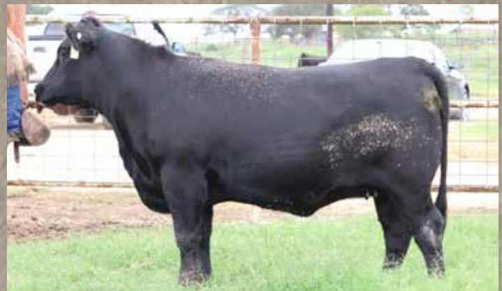
LOT 119 MS S ROCK BONNIE 769G5

The last calf of the 14 year old Jauer 589 granddaughter, 769R, who always produces cattle with added performance and muscle. BW 25%, RADG 15%, REA 25%.