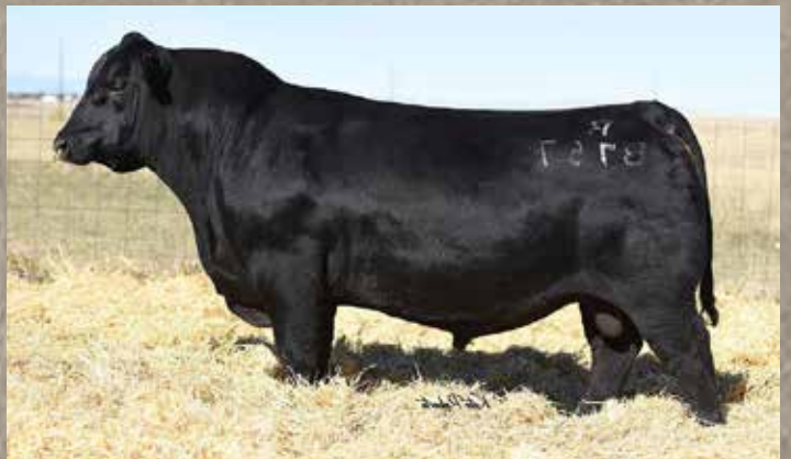
SIRE OF LOT 137 TEHAMA TAHOE B767

Another low birth weight Sonic daughter from the Sunset Pride family with ideal milk, 100+ yearling weight and added marbling. CED 35%, BW 40%, Marb 25%.