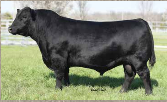
SIRE OF LOT 23 BUFORD REBOUND C837

RITO 707 OF IDEAL 3407 7075 S A V BLACKCAP MAY 4136 S A V BISMARCK 5682 S A V ELBA 4436 O C C PAXTON 730P BOHI ABIGALE 6014 COLE CREEK CEDAR RIDGE 1V MS S ROCK GLORY 335F8 Rebound son out of nice young Charlo daughter. Full brothers in blood, Buford Rebound and Buford Pathfinder are both sons of one of the most phenotypically complete cows in the breed, Buford Elba 811Y. They have worked well in this herd, and I am excited to see their daughters in production. Several sons and daughters of Rebound and Pathfinder sell, check them out. Should work well on heifers or cows. SC 10%.