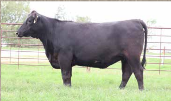
LOT 136 MS S ROCK SUNSET PRIDE 5028G4