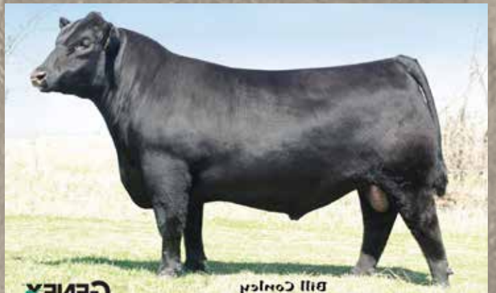
PATERNAL GRANDSIRE OF LOT 35 B C LOOKOUT 7024

Lookout grandson with added growth performance. SC 25%.