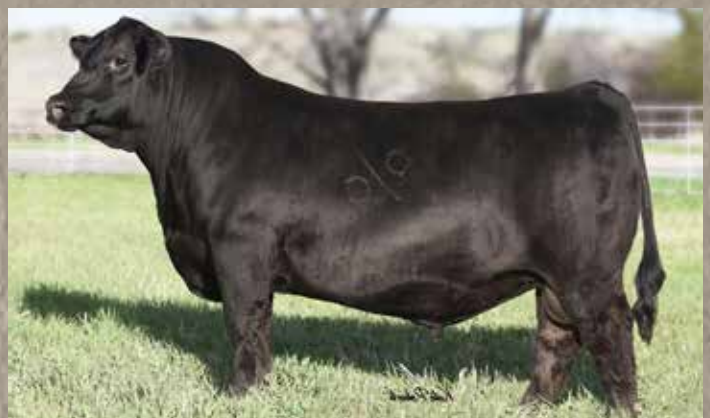
SIRE OF LOT 127 COLEMAN ENGAGE 5255

Another well designed, balanced trait young female. Her dam by Koupal Advance 28 is a really good producing young cow. I don't have many Advance daughters, but the ones I do have are all top producers. WW 15%, YW 25%, SC 35%, CWT 30%, Marb 35%, $B 35%.