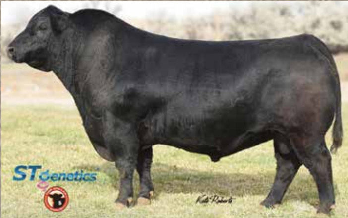
AI SERVICE SIRE FOR LOT 148 MUSGRAVE 316 EXCLUSIVE

Another young cow out of 335A with added performance and muscle. Son sells as lot 15. WW 40%, CEM 40%, REA 40%.