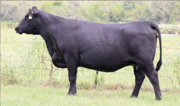
LOT 146 MS S ROCK QUEEN 335D24

Productive daughter of S Rock Really Windy 335A. His daughters have made attractive, sound productive females and his sons have been really well received in past sales. He tends to add some performance and be slicker haired. Her granddam, 335R4, was a really good cow leaving a lot of good females in the herd. She stayed in the herd until she was almost 15. WW 40%, YW 40%, RADG 25%.