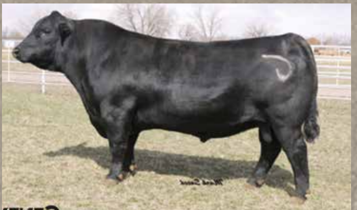
MATERNAL GRANDSIRE OF LOT 43 CONNEALY THUNDER

Calving ease with added milk for those producers looking for that. Linebred to Final Answer and 639N, he should breed with increased consistency. CED 30%, BW 25%, RADG 40%, SC 15%, HP 15%, Milk 10%, $W 30%.