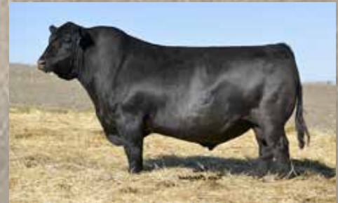
MATERNAL GRANDSIRE OF LOT 20 BASIN PAYWEIGHT 1682

Very complete J & J Weigh Up son out of an extremely gentle, moderate framed Basin Payweight 1682 dam. Study this bull from all the angles and study his EPD profile and pedigree. He is one to build a herd around. Granddam, a granddaughter herself of the Ms S Rock Glory 335R7 cow, has been an exceptional cow and has also been used to help build the nucleus half-blood herd in the Solid Rock Ranch new genetics Brangus herd. Check out her half-blood Maximizer son selling as lot 82. CED 10%, BW 5%, WW 15%, YW 15%, RADG 30%, SC 15%, DOC 15%, CEM 15%, CWT 30%, Marb 40%, $W 20%.