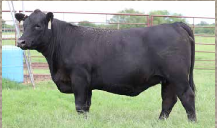
Lot 111 | Ms S Rock Queen 335G43 | Reg #: 19787969