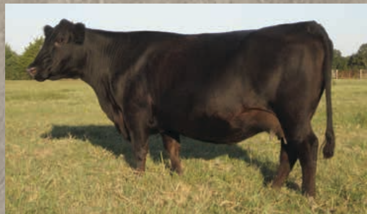
MATERNAL GRANDDAM OF LOT 145 MS S ROCK NEWSLINE 335R4

Payweight 1682 daughter with a deep maternal pedigree. Her powerful son sells as lot 9, check him out. YW 40%, SC 40%, Milk 35%, $W 30%.