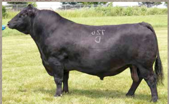
SITZ STELLAR 726D