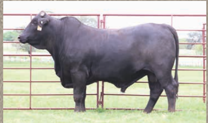
LOT 82 S ROCK MANSO 338 335G7

He is a lighter BW and CED. true F1 bull. He is capable of maximizing hybrid vigor, adding a touch more Bos Indicus to his offspring, and siring a black calf with power and longevity. He ranks in the Brangus breed's top 25% CED, 20% BW and top 25% Fertility Index while his dam records top 10% CED, 15% BW, 20% WW and 25% YW Angus EPDS. The best of both worlds.