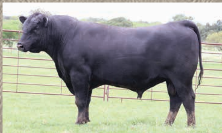
LOT 50 S ROCK BLACK GRANITE 846F6

Calving ease with a little extra milk projected in this stylish Black Granite son. CED 10%, BW 25%, CEM 25%, Milk 35%.