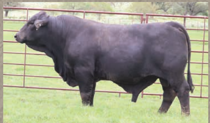
LOT 86 S ROCK BILLY THE KID 98F