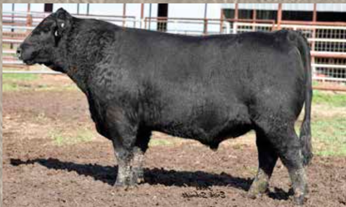
SIRE OF LOT 27 S ROCK FINAL ANSWER 308B4

Growth and muscle abound in this powerful Resource son. His Thunder dam has been a top donor for me and I have four top daughters in production as well. Look for her Charlo and Jet Black sons in next year's sale. WW 30%, YW 30%, HP 20%, CWT 25%, REA 20%, $W 35%, $B 40%.