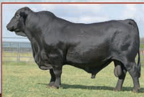
< STONEWALL OF RRR 222W6 $50 Registered, $25 Commercial